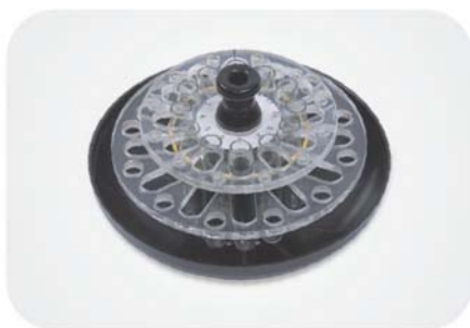
12 place Rotor