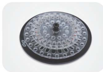
24 place Rotor